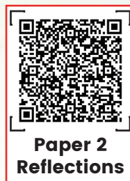
Paper 2 Reflections