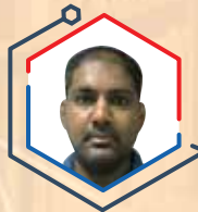
AIR 6 KOYA SHREE HARSHA