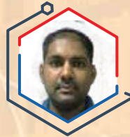
AIR 6 KOYA SHREE HARSHA